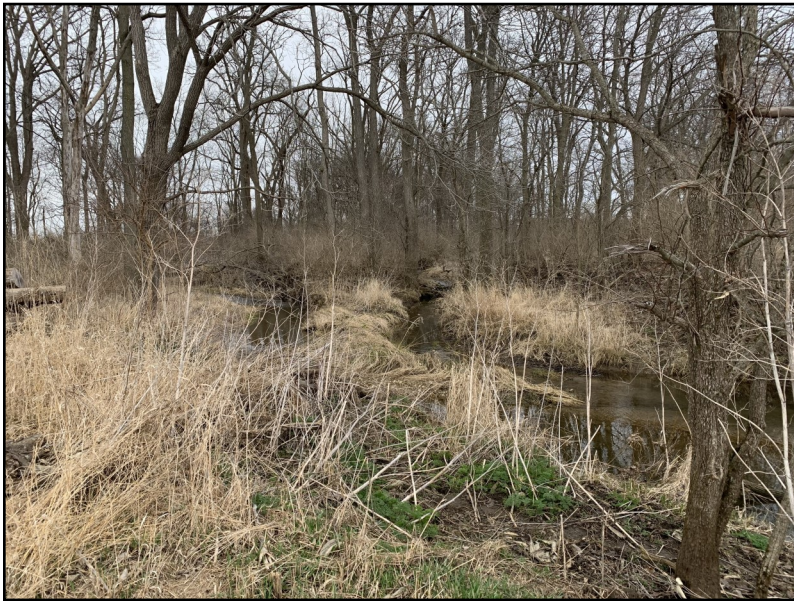
Headwaters of the Little Miami River—a state & national scenic river